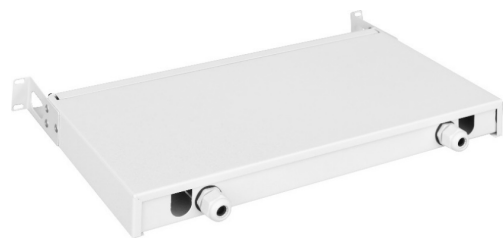
PS 19" 1U 24xDX W bp