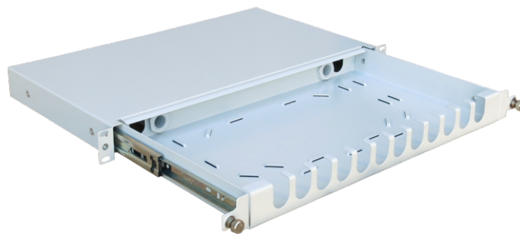
PS 19" 1U W patchcord