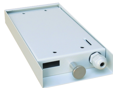
PSN - A