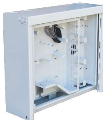
M 42/48/16 ST - DX 72J