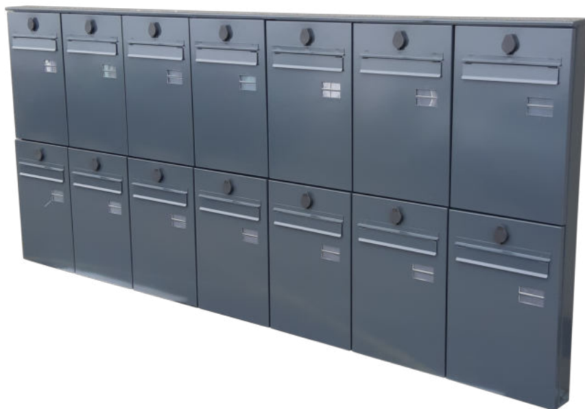
Blok skrzynek na listy