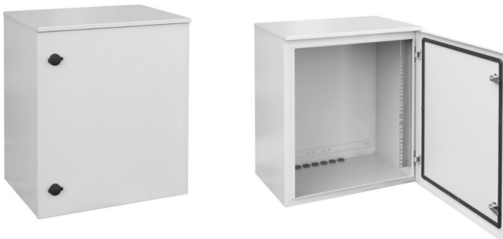
SM-64/55/41 19" 12U