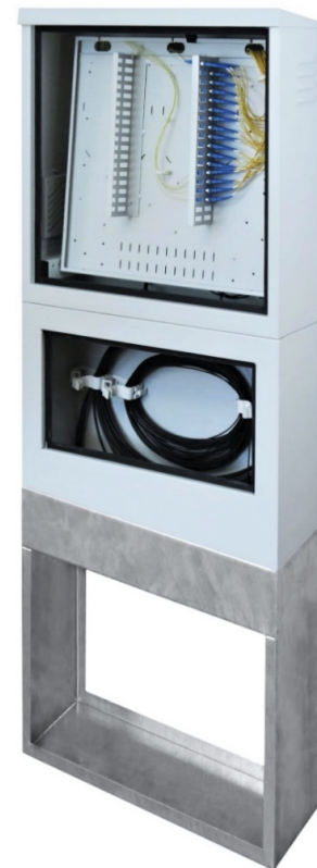
RSZ-170/60/20 - 144J