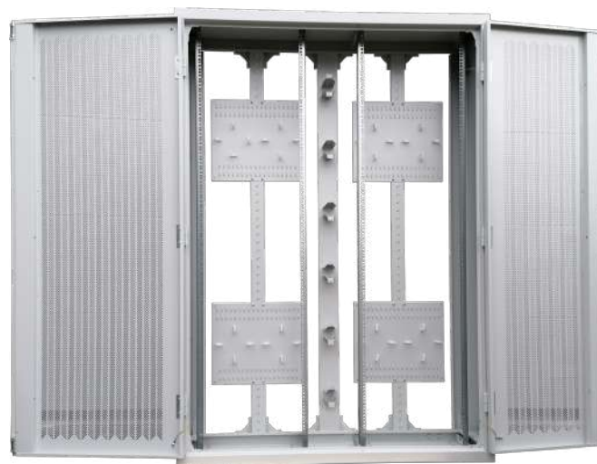
SWS 42U 19" 140x35