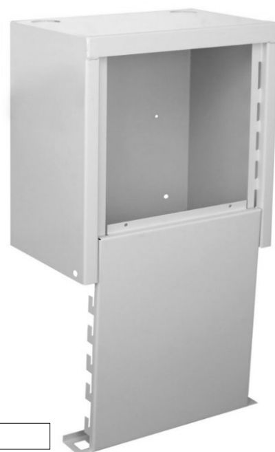
M 40/30/20 ST