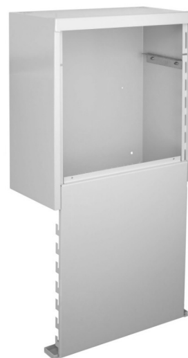
M 40/30/20 WZM