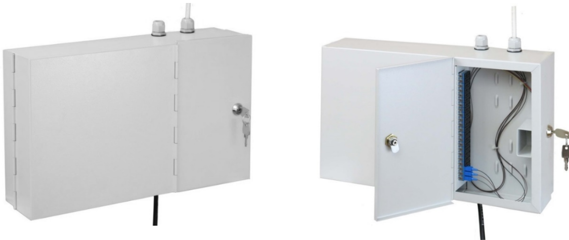
SRS 28/45/12 44J DX