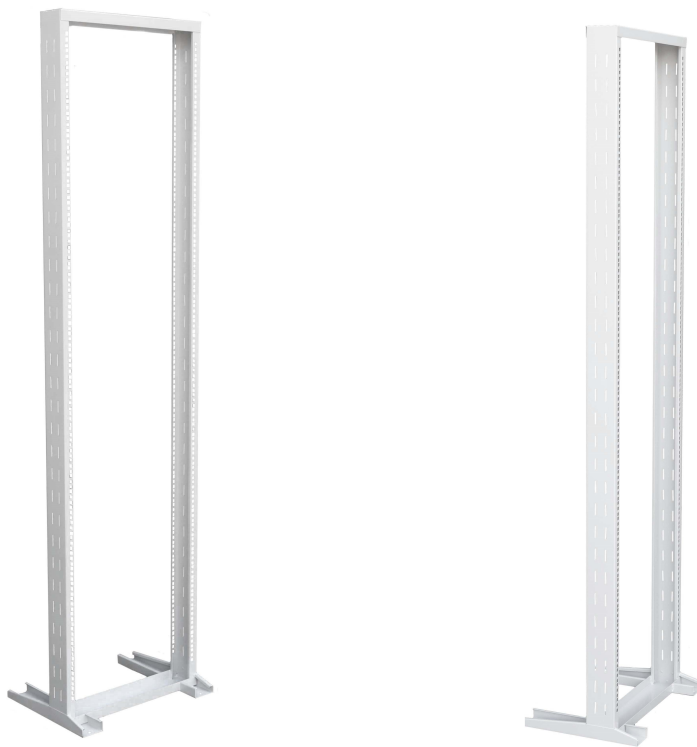
Stojack Rack 19" 42U