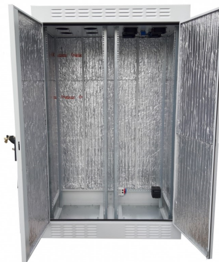
SZK 36U 192/120/80